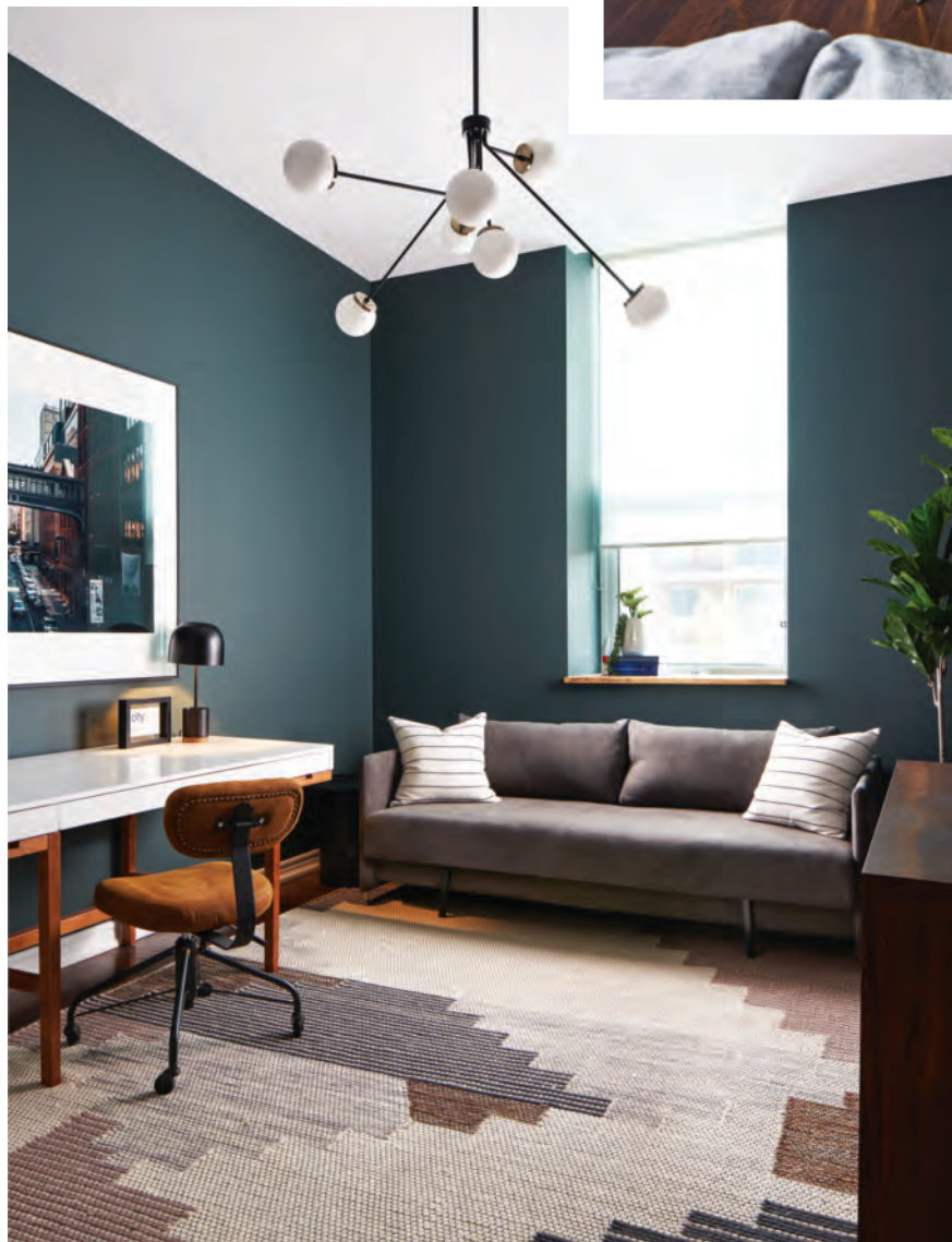
ABOVE: The dining area is particularly striking with a hand-painted watercolour wallpaper mural in shades of deep blue. LEFT: A modern chandelier enhances the office cum guest bedroom, and adds a touch of fun. BELOW: Saturated grey-green walls are handsome and bold, and work beautifully with rich wood tones.